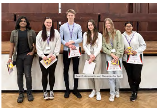
Year 12 Tutor Awards