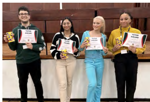
Year 13 Tutor Awards