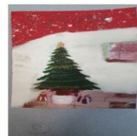
3- Angie .C 7F