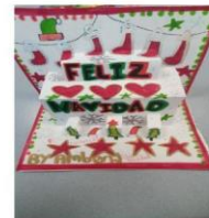
2- Amber .W 7P