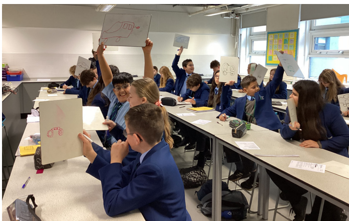
CASE lesson with Year 7 students