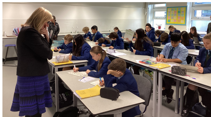
CASE lesson with Year 7 students