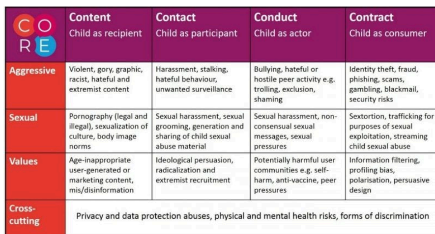
Figure 2: The CO:RE classification of online risks to children (2021)

The school provides a safe environment for students to learn and work, including when online. Filtering and monitoring are both important parts of safeguarding students and staff from potentially harmful and inappropriate online material. The safeguarding team receives live smoothwall alerts for all triggered internet searches including those that deliver a false positive. Where an alert indicates a concern this is picked up by the safeguarding team for further investigation.