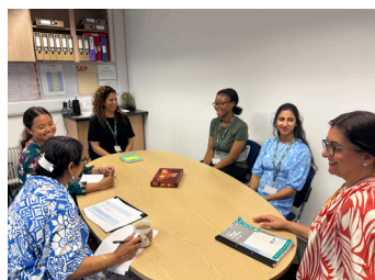
Morning at Hermitage