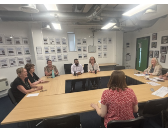
Morning at Ruislip High