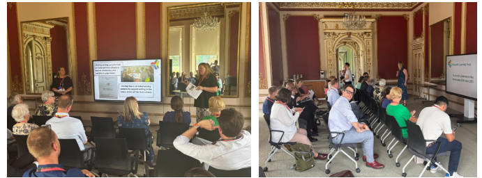
Afternoon at ACS International School