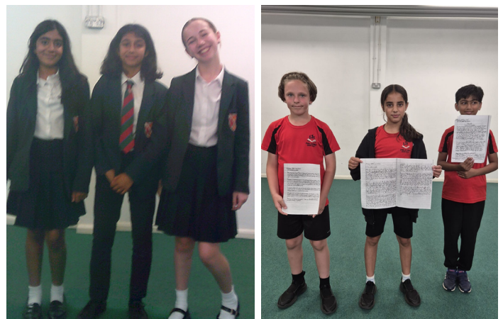
Participants in the oracy celebration