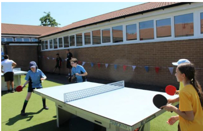
Teams competing in the table tennis competition