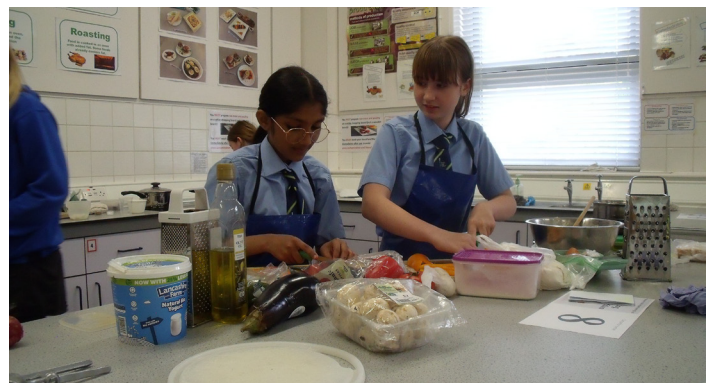
Participants in the cooking competition