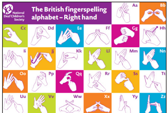
The British fingerspelling alphabet