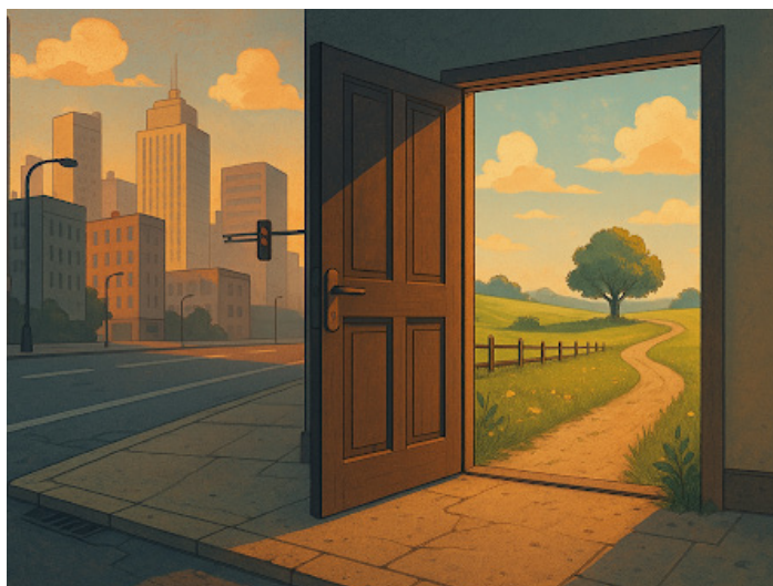
One of the most popular images chosen by Year 6 students