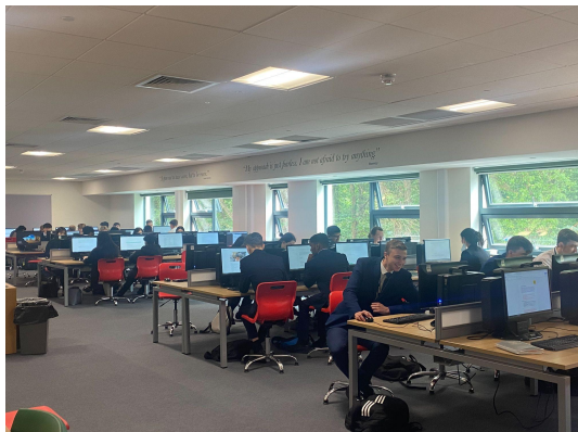
Study room silent study

Free room list for independent study periods