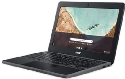
Acer Chromebook 311 C722